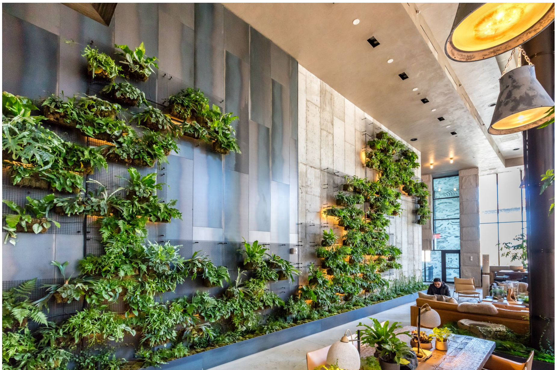
A green wall inside the 1Hotel Brooklyn Bridge in Dumbo.

2) Public Hotel: Ian Schrager’s latest addition to the world of New York hospitality was one of the most buzzed-about openings of the year. (The Standard-in-2009 levels of hand-wringing over its racier patrons was surely a boon in that sense.) Though reviews on its public-facing spaces, including Jean-Georges Vongerichten’s Public Kitchen, haven’t been great, the building itself (another Herzog & de Meuron joint) is a looker—how many times did its flashy neon escalators pop up on Instagram this year?