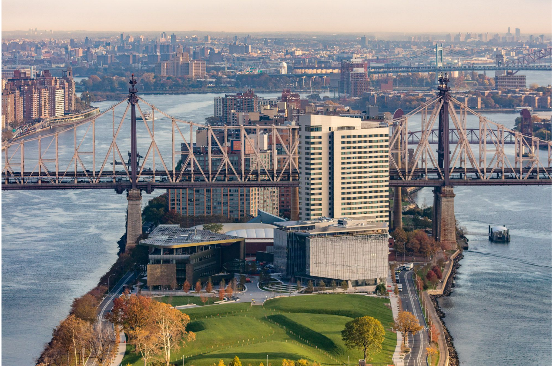
Cornell Tech's Roosevelt Island campus.