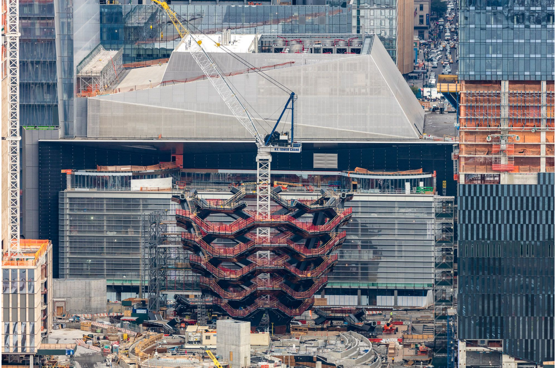
Thomas Heatherwick's Vessel on the rise in Hudson Yards.