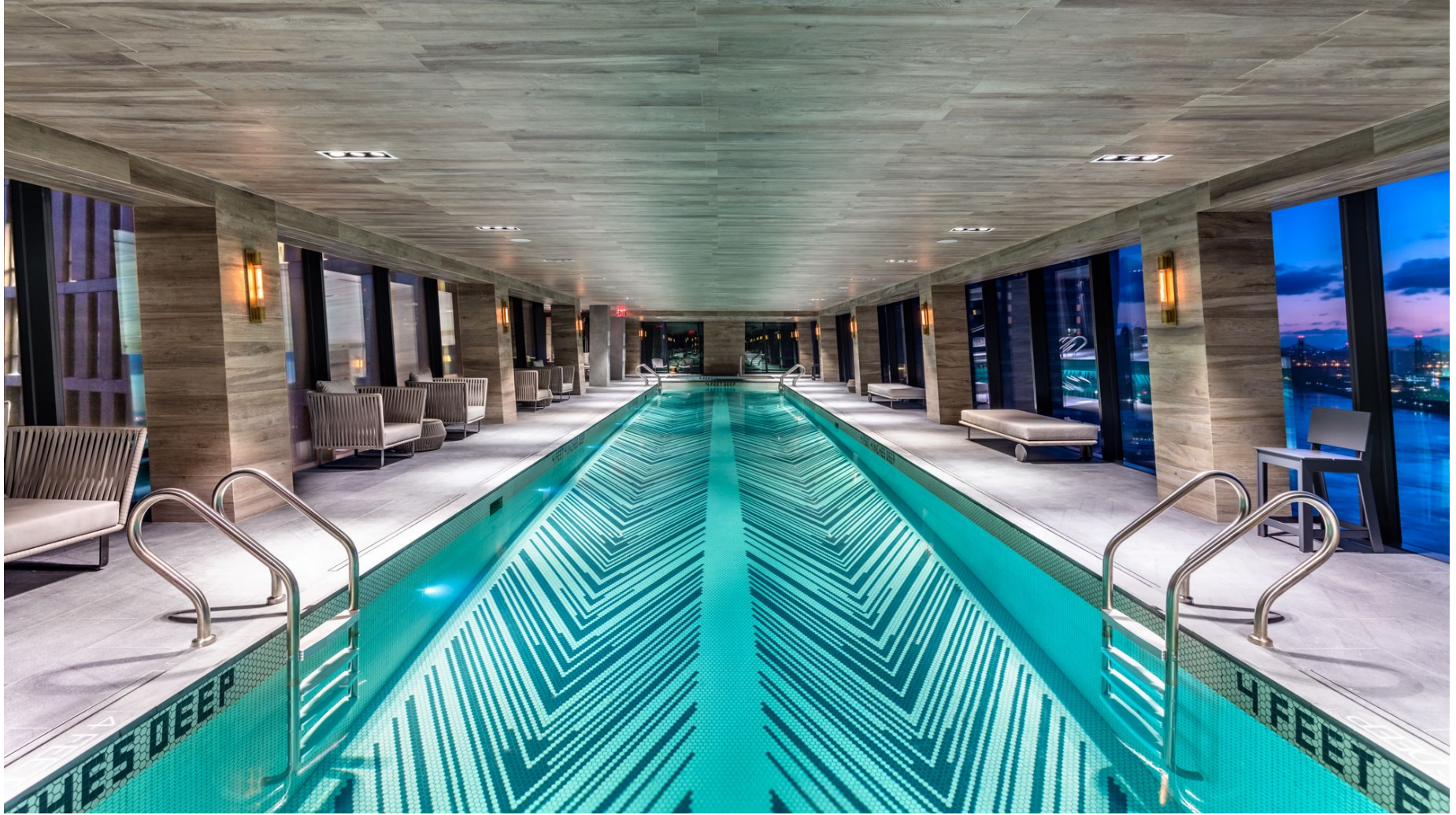
The 75-foot pool situated in the skybridge of the American Copper Buildings.

What will be the first movie to use the skybridge that links the two 40-plus-story buildings as its villain's hideout? It could have been Teenage Mutant Ninja Turtles but—probably just as well—they called too soon. Some less cartoonish evil must take place in that three-story parallelogram some 30 stories in the air, with chevron floors and chevron light fixtures and, most glamorous of all, a blue-on-blue tiled chevron lap pool suspended between views of either the Empire State Building and the East River.