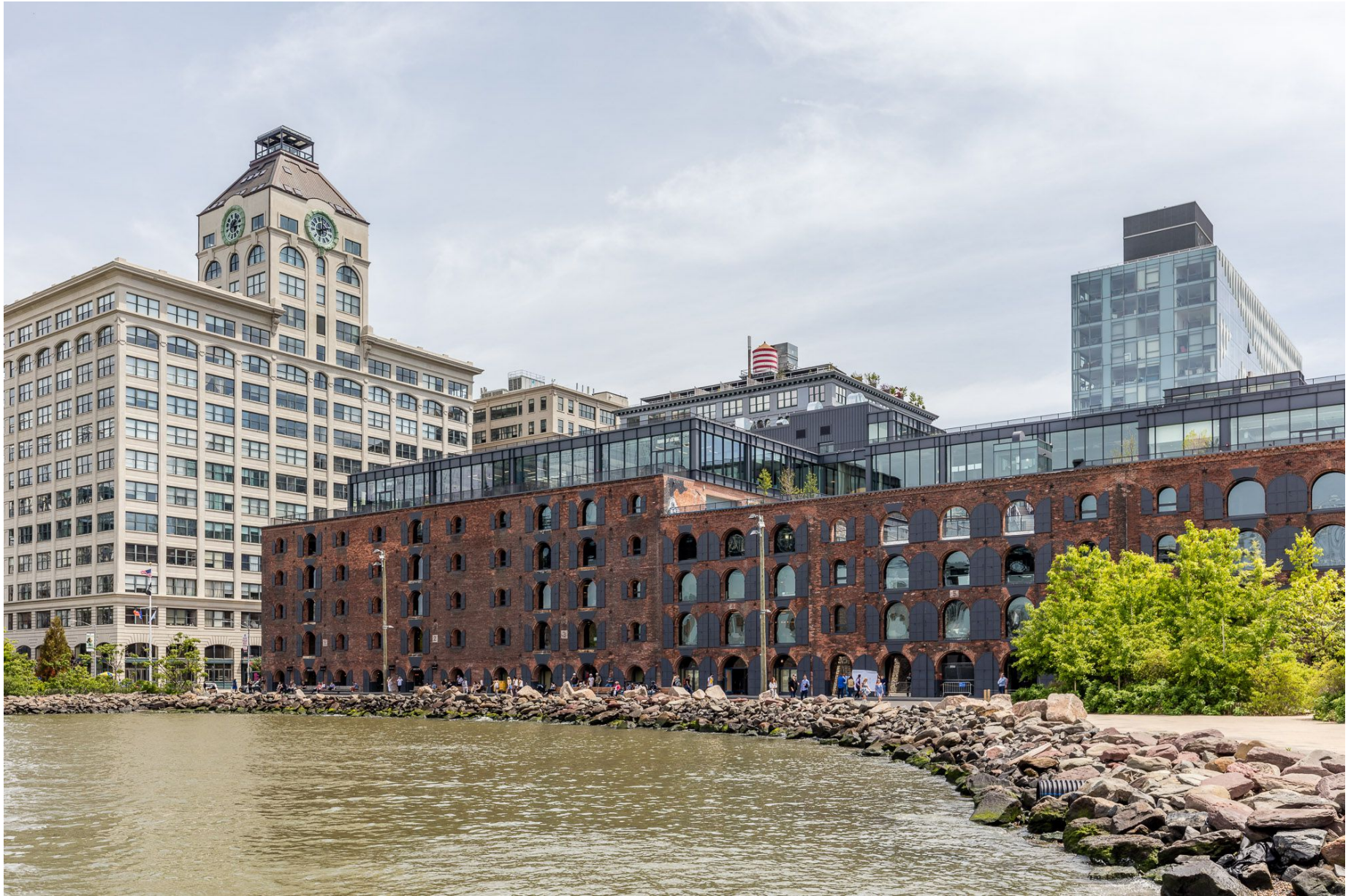
Empire Stores, a warehouse conversion on the Brooklyn waterfront.

Still, there were some projects worth celebrating. Here now, the best new architecture—reveals, makeovers, and conversions included—of 2017.