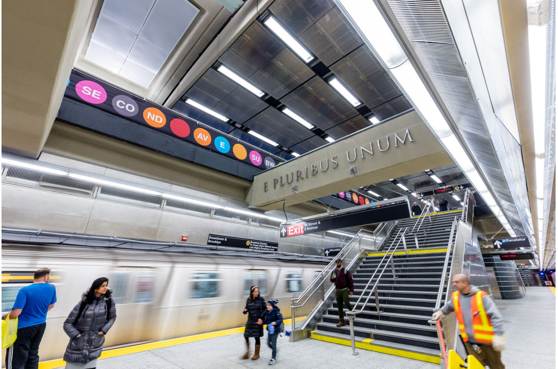
One of the Second Avenue subway stations, which opened at the beginning of 2017.