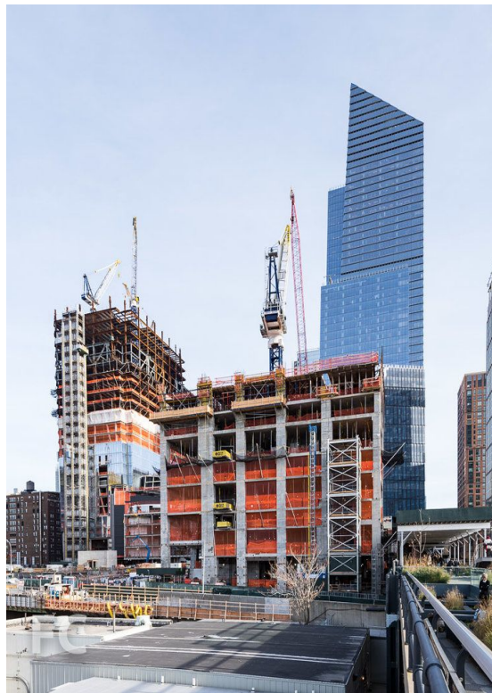
15 Hudson Yards and the Shed under construction Field Condition

And it'll be some time before those elements come to fruition: Construction on 15 Hudson Yards is currently underway, with an anticipated completion date of 2018 and move-ins happening soon thereafter. (Coincidentally, Field Condition recently posted some photos of the tower and the Shed in progress, showing how far along the two buildings are at this point.) For now, the photos above will have to serve as the best facsimile.