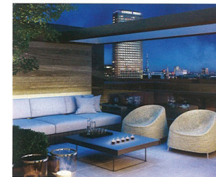
Clockwise from above left: Zaha Hadid's design for 520 West 28th Street, New York City; South Quay Plaza; a terrace at the Rathbone Place development, London

Trend alert: you need one of Ensata's natural swimming pools