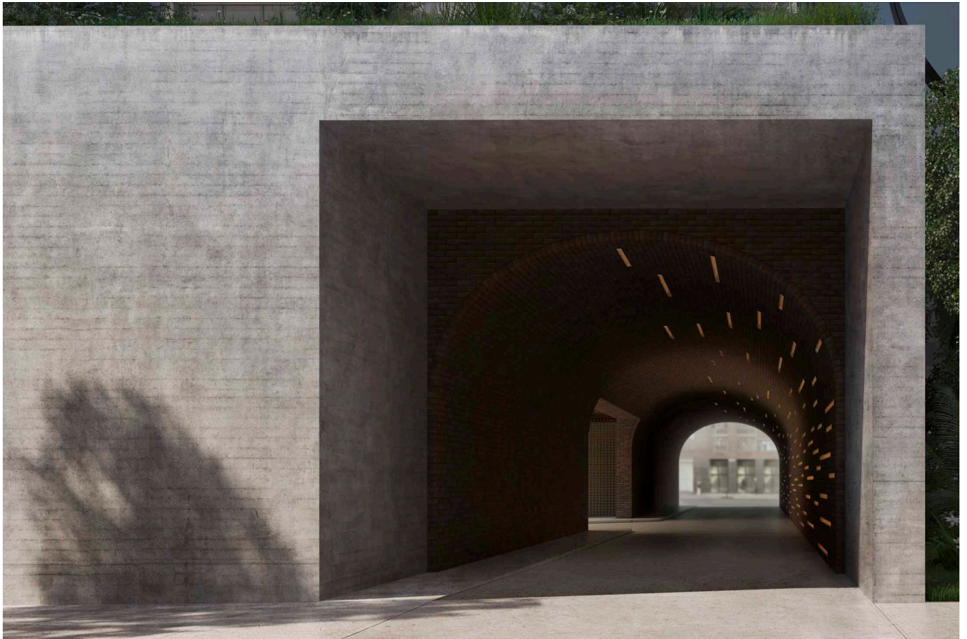
The driveway at Jardim.

Berger might claim it's unique within the area but elsewhere in Manhattan, that same amenity—call it a driveway, motor court or porte-cochère —is emerging as the latest must-have for any building aiming to lure Manhattan's elite.