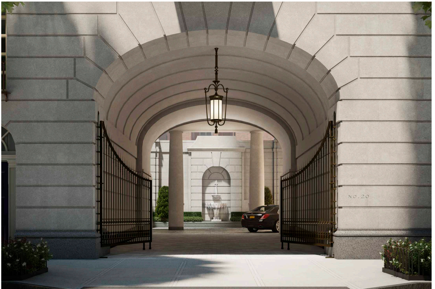
The driveway at 20 East End Avenue.