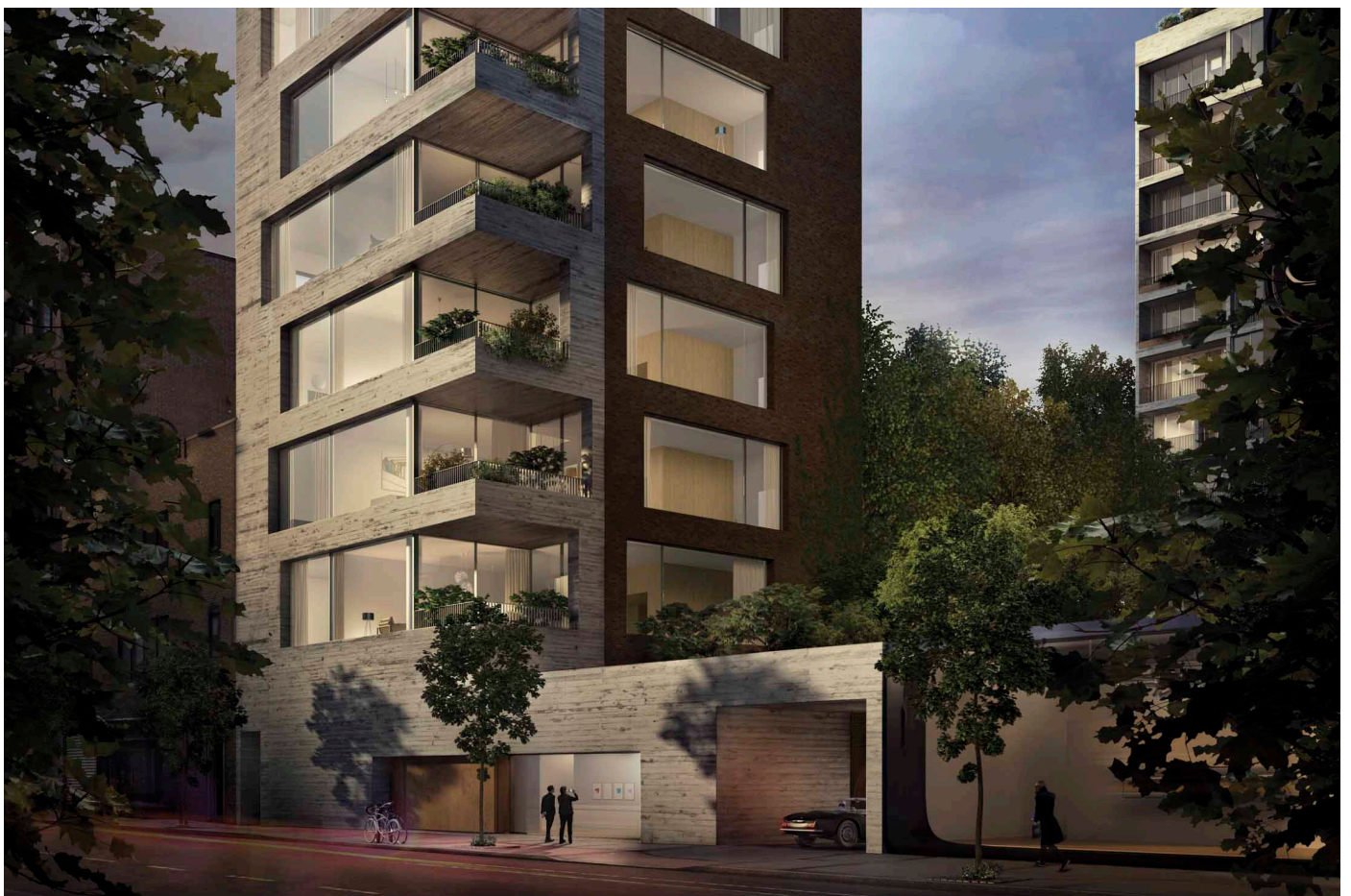
Jardim in West Chelsea.