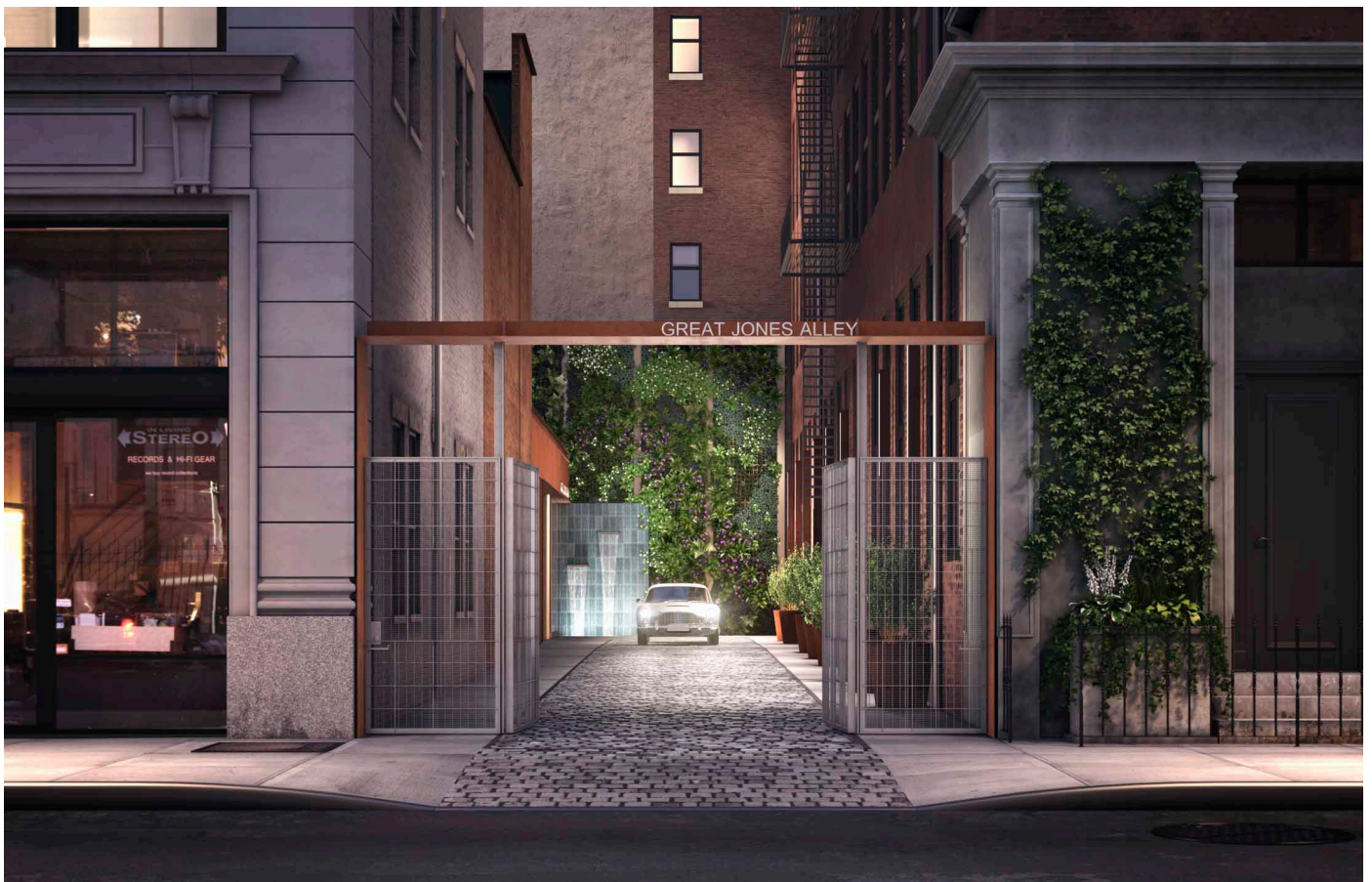
The driveway at 1 Great Jones Alley.