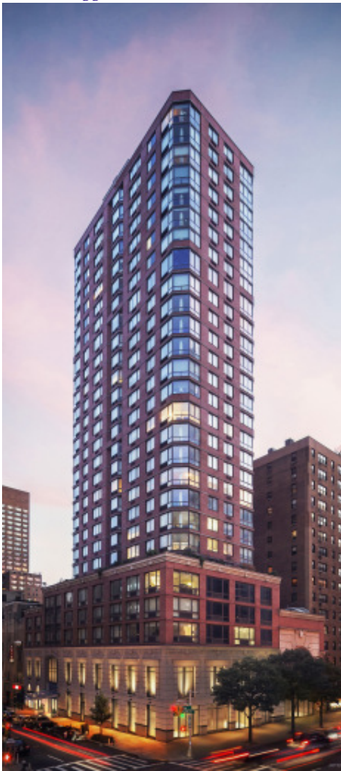
Units at RFR's amenity-packed 300 E. 64th St. start at $725,000 for a studio.