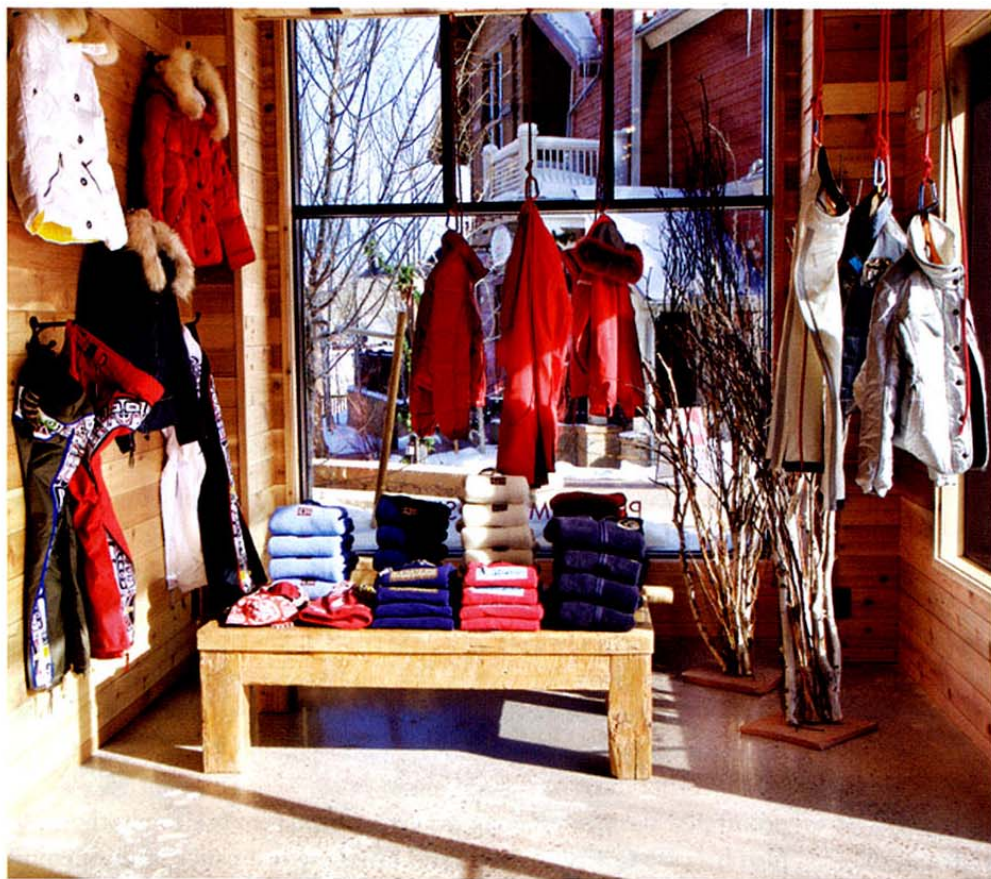
The interior of the new Performance Ski in Snowmass.

Snowmass has always felt like Aspen's unnoticed kid sister on the shopping front. That's still the case, but new retail arriving as part of Snowmass' Base Village development hints at a more attractive future.